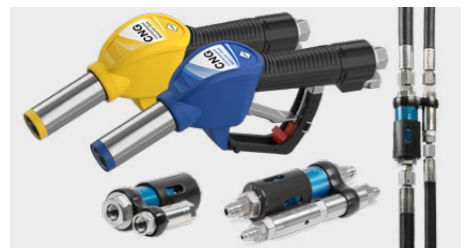
SB-CNG safety breaks, hose assemblies CNG