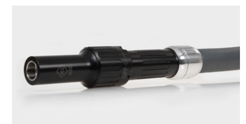
N-H2-H35 Hydrogen Nozzle with CH-H2 38 Cover Hose