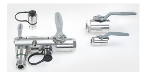
Ball Valves and Quick Couplers