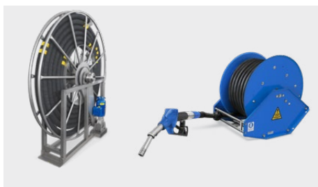
Customised Hose Reel and VR Hose Reel

The ERV-H2+ rubber expansion joints are suitable for the transfer up to 100% hydrogen as well as for 100% methane or other mixtures, so-called 'Hythane'. Due to their low permeation, they can be used for any kind of piping systems in the industrial sector and for ships. The operating pressure is 25 bar (2,5 MPa).