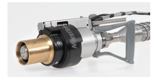
N-LH2-P Pneumatic truck nozzle with hose assembly