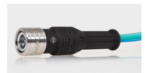
N-H2-H70UHF Hydrogen Nozzle