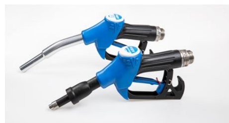
ZVA AdBlue LV and ZVA AdBlue HV nozzles