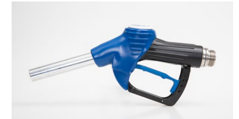
ZV SW nozzle