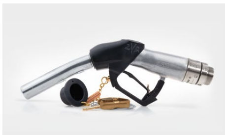
ZVA 32 AF, EKG, GKG

The ZVA 32 AF is an automatic aviation nozzle capable of providing 200 l/min fuel. The nozzle is usable for civil and military fuelling application such as JET-A1 and AVGAS. All parts that are in contact with fuel are free of non-ferrous metals . The overall design complies to the requirements of JIG and ATA Spec .