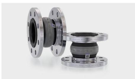
Rubber Expansion Joints ERV-H2+

With the H2 hydrogen hoses for the low-pressure range , ELAFLEX supplies \Omega/T connection hoses for the transfer up to 100% hydrogen. The continuous smooth inner lining enables a processing of hydrogen e.g. the chemical or steel industry. The robust hose construction with 60 bar (6 MPa) operating pressure has a very low permeation of < 0.36 \text{ Ncm}^3/\text{h} . The H2 hoses DN 13-50 are available with crimping ferrules, SPANNLOC or SPANNFIX clamps.