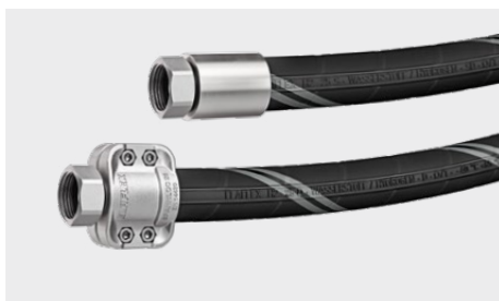
H2 Hydrogen Hoses for Low Pressure

Available for ELAFLEX Yellow Band hoses like HD, TW or LTW and all chemical hoses acc. to EN 12115 in sizes from DN 15 to DN 80. Thanks to the proven leak detection system from ELAFLEX Group's industry expert SGB , DualSafe can be used anywhere and significantly simplifies resource-planning processes.