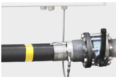
new ELAFLEX DualSafe

The ZVA 32 AF is an automatic aviation nozzle capable of providing 200 l/min fuel. The nozzle is usable for civil and military fuelling application such as JET-A1 and AVGAS. All parts that are in contact with fuel are free of non-ferrous metals . The overall design complies to the requirements of JIG and ATA Spec .