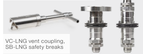
VC-LNG vent coupling, SB-LNG safety breaks